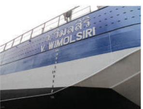
Wimonsiri In 2014, heavy lifting barge under ABS classification is built by us also.