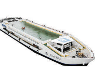
Riverside 4 In 2014, if you see a good looking dinner cruise sail on the Chao Praya river, that vessel is built by us.