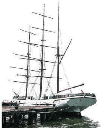
Sirimahannop In 2016, we were responsible of this 3 poles sailboat in the part of hull structure for Bangkok dockyard company limited.