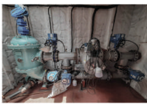
Water Ballast Treatment In 2020, according to the IMO new regulation there was the first vessel come to install the WBTS with us.