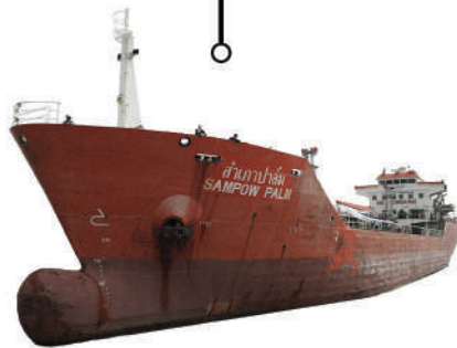
Sampow Palm double hull In 2015, Sampow Palm or aka our boss' vessel was modified to create the double hull. At that time, we were specialized as we have done for many vessel.