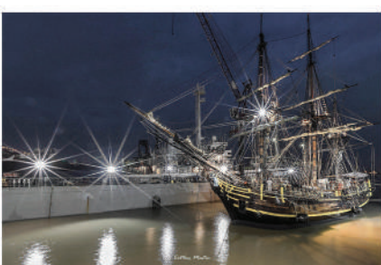
Pirate of Calibrian In 2017, Bounty is the real ship that has been in movie The Pirate of Calibrian.