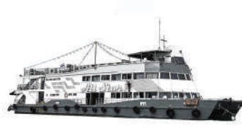
All Star Cruise In 2018, we built another dinner cruise for one of the famous tourist company in Pataya.